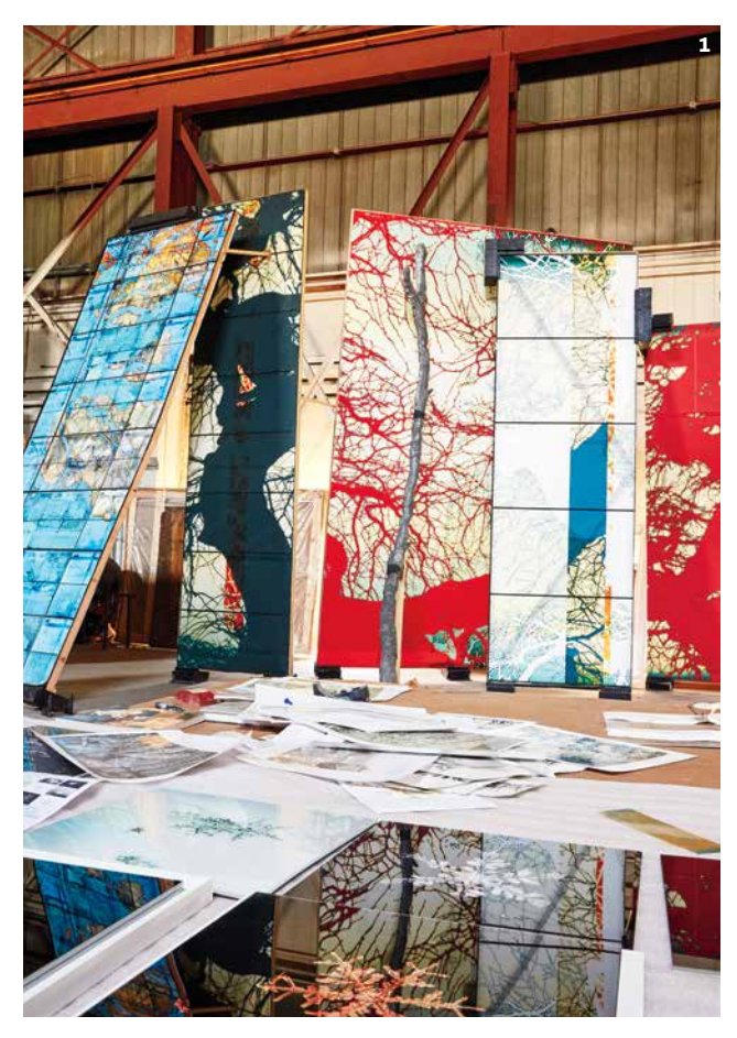
1. GLASS PANELS FROM A RECENT PROJECT FOR PRINCETON UNIVERSITY. 2. AMONG THE MATERIALS ON A WORK SURFACE ARE ALBUMS FOR THE STARNS' NEW SERIES, DEBUTING AT THE RAMORY SHOW AND TRAVELING TO THE BALDWIN GALLERY IN ASPEN, COLORADO. 3. A NEWLY RENOVATED STUDIO SPACE.